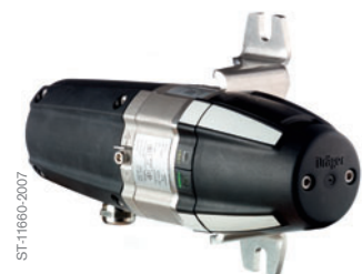
Dräger PIR 7200 Configurable IR gas detector for reliable detection of carbon dioxide