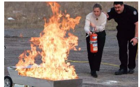
fire extinguisher training realistic simulation for safe practice

The TUTOR is assembled under factory approval of CSA International, a recognized 3rd party authority (Certificate of Compliance no. 1811189) and bears the respective CSA marking. For more information visit www.csa-international.org .