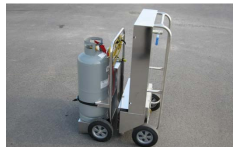
mobility and storage designed for ease of handling and transport