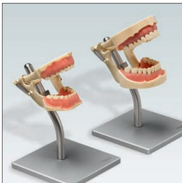
ANA-4 DAFD 16

dental model ANA-4 DAF with support (right)