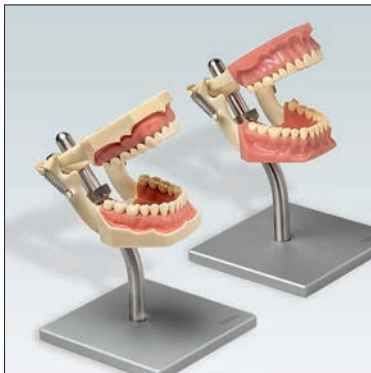
A-3 DAD 16

upper and lower model jaws scale 5 : 1, tooth and gingiva coloured plastic with individual contact points